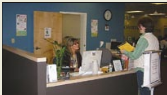
Top of page: Summer youth employment program training Above: WorkSource Renton helps with job training and job coaching

Oh, and I almost forgot to mention: I am working at a higher salary than my last job. Thank you, King County Dislocated Worker Program!