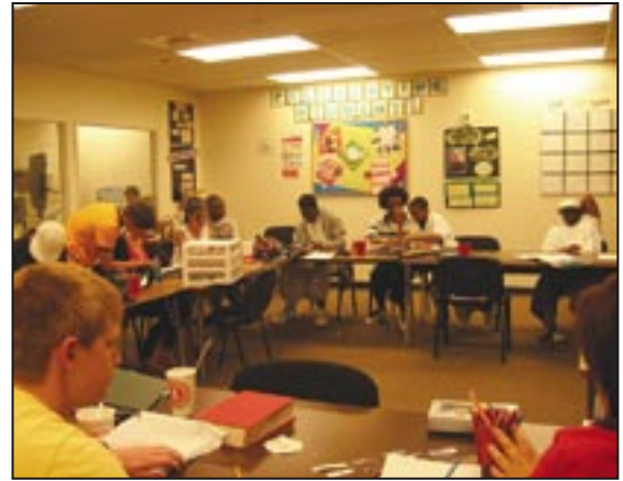
Above: YouthSource classroom.