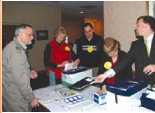
Developmental Disabilities Board and Parent Coalition members greet legislators at annual forum

The department places the highest value on the input and guidance on human services funding and program planning provided by the clients, consumers, family members and others who serve on our ten citizen advisory and oversight boards. More than 120 private citizens volunteer their time every month to attend meetings, plan public events, educate the public, meet with state legislators, serve on review panels, and more. The department is grateful to all of them for their efforts to improve and strengthen regional human services.