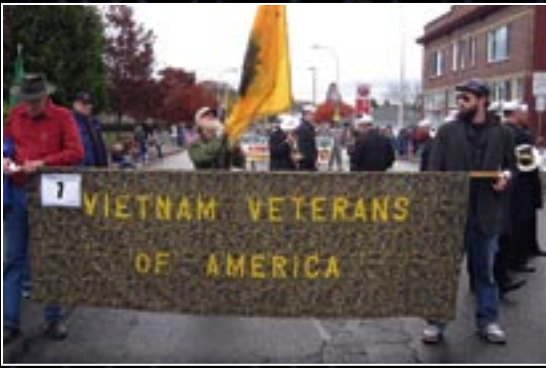
Roger Welles, member of both the Veterans Program Board and Veterans Levy Board marches in parade with Nate Hinde (right)

Program expanded services to more veterans than previous years and in more locations, including a part-time office in Auburn that opened in 2008. Individualized services were enhanced through case management and access to Post Traumatic Stress Disorder treatment was increased. A total of 2,039 veterans received PTSD treatment and 95.7% showed improved functioning. The Veteran's Incarcerated Project, a national model for jail intervention services, expanded services to veterans in regional jails and helped 188 jailed veterans by providing housing, treatment and other supports, resulting in greater stability for the vets and a savings to the county of 6,021 jail days.