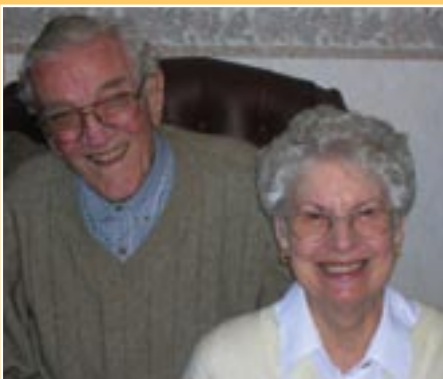
From top: Opportunity Greenway summer youth program teaches "green" construction; Lauren Heights affordable housing in Issaquah; helping seniors live independent lives in the community.