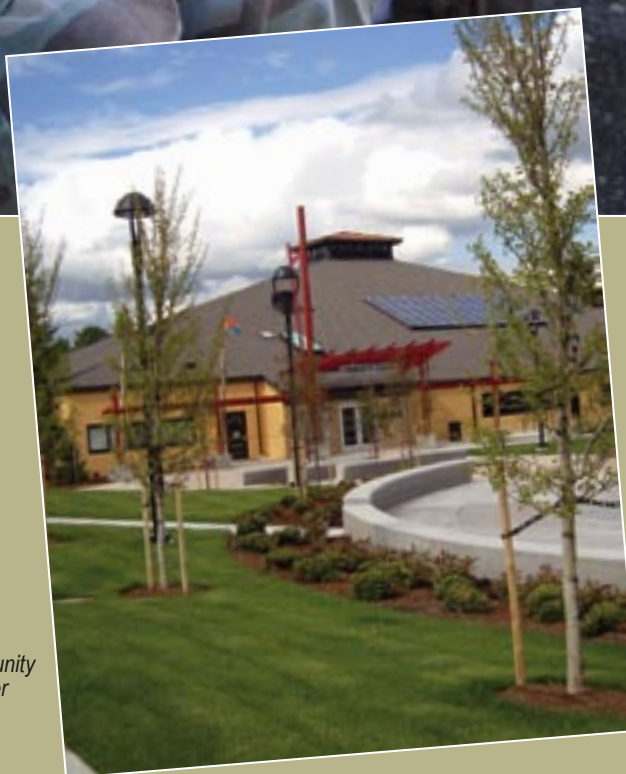
Auburn Veterans Day Parade; Wiley Community Center in White Center