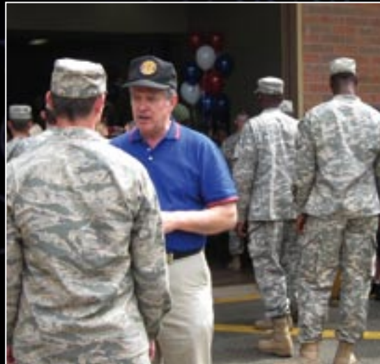
Veterans meet at resource fair (above and left)

Community Services – Programs in CSD assist people of all ages to achieve and maintain healthier lives. The Aging Program works to help older adults maintain their independence through health services, information and referral, exercise, social activities, transportation, and other supports. Over 26,150 people participated in county-sponsored programs and activities. The Women's Program helped 3,811 survivors of domestic violence and 3,542 survivors of sexual assault by providing connections to crisis intervention, referral, counseling, legal advocacy, emergency shelter and transitional housing. Youth and Family Services agencies helped at-risk and juvenile