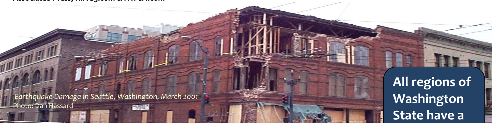
Earthquake Damage in Seattle, Washington, March 2009

SEATTLE - There are no immediate reports of damage from a 4.5 magnitude earthquake that rattled the Seattle and Puget Sound area at 5:25 a.m. Friday January 30, 2009. But it woke a lot of people up. The U.S. Geological Survey said the quake was centered 14 miles northwest of Seattle, about two miles northwest of Indianola. USGS