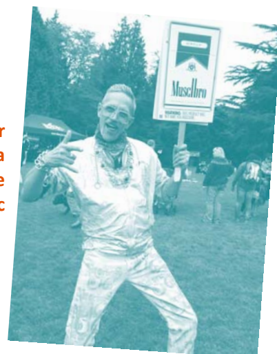
Gay City volunteer promotes a tobacco-free Pride picnic