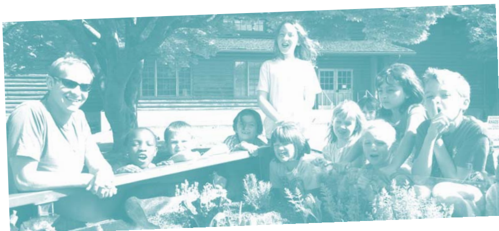
The Farm Truck/educators arrive at the Des Moines Field House to teach Des Moines' Camp KHAOS youth