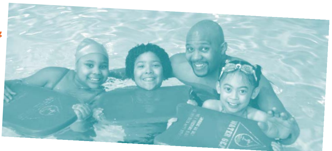
Friday Night Swimming at Medgar Evers pool made possible by a partnership with Odessa Brown Children's Clinic