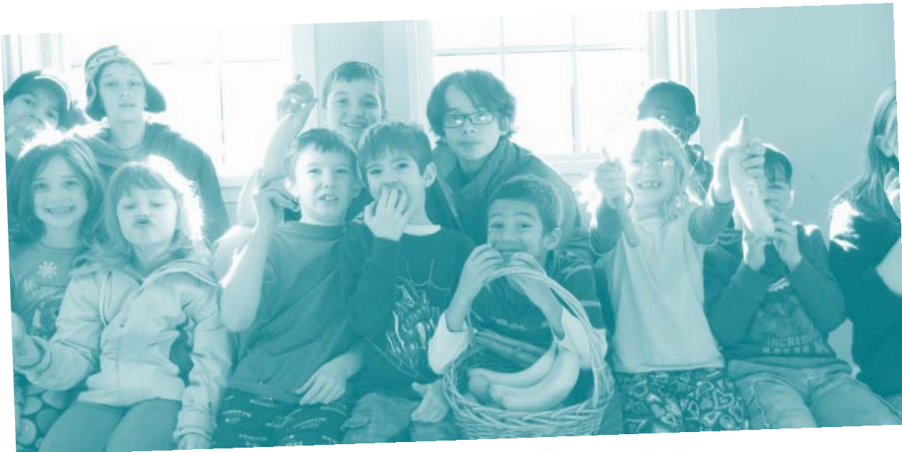
Des Moines Youth Camps Offer Healthy "Go" Food Choices