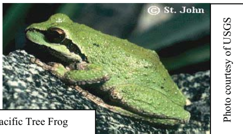
Pacific Tree Frog

Bleach, vegetable oil, motor oil and soap are not registered for use as pesticides and cannot be used for control of mosquito larvae or eggs. Mosquito control must comply with federal and state requirements. It would be illegal to put these substances into waters of the state that are not completely contained without a permit, even if they are on private property. Many substances, such as petroleum products, should not be used in a manner that will allow them to get into natural water systems, groundwater, or drainage systems.