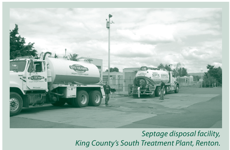
Septage disposal facility, King County's South Treatment Plant, Renton.

Businesses may not wish to apply for a permit to discharge septage, or KCIW might determine that a business's waste cannot be accepted at the county operated facility. In those cases businesses will need to find alternative disposal sites. They can find assistance by contacting septage haulers, local public health agencies or the Washington State Department of Ecology. (See Resources, page 5.)