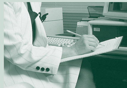
Maintain waste disposal records

King County requires that businesses connected to the county's sewer system practice specific BMPs based on the category of business, such as dental practices, photo processors and medical offices with x-ray equipment.