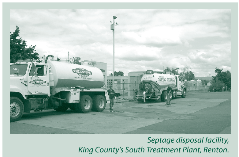
Septage disposal facility, King County's South Treatment Plant, Renton.

Businesses may not wish to apply for a permit to discharge septage, or KCIW might determine that a business's waste cannot be accepted at the county operated facility. In those cases businesses will need to find alternative disposal sites. They can find assistance by contacting septage haulers, local public health agencies or the Washington State Department of Ecology. (See Resources, page 5.)