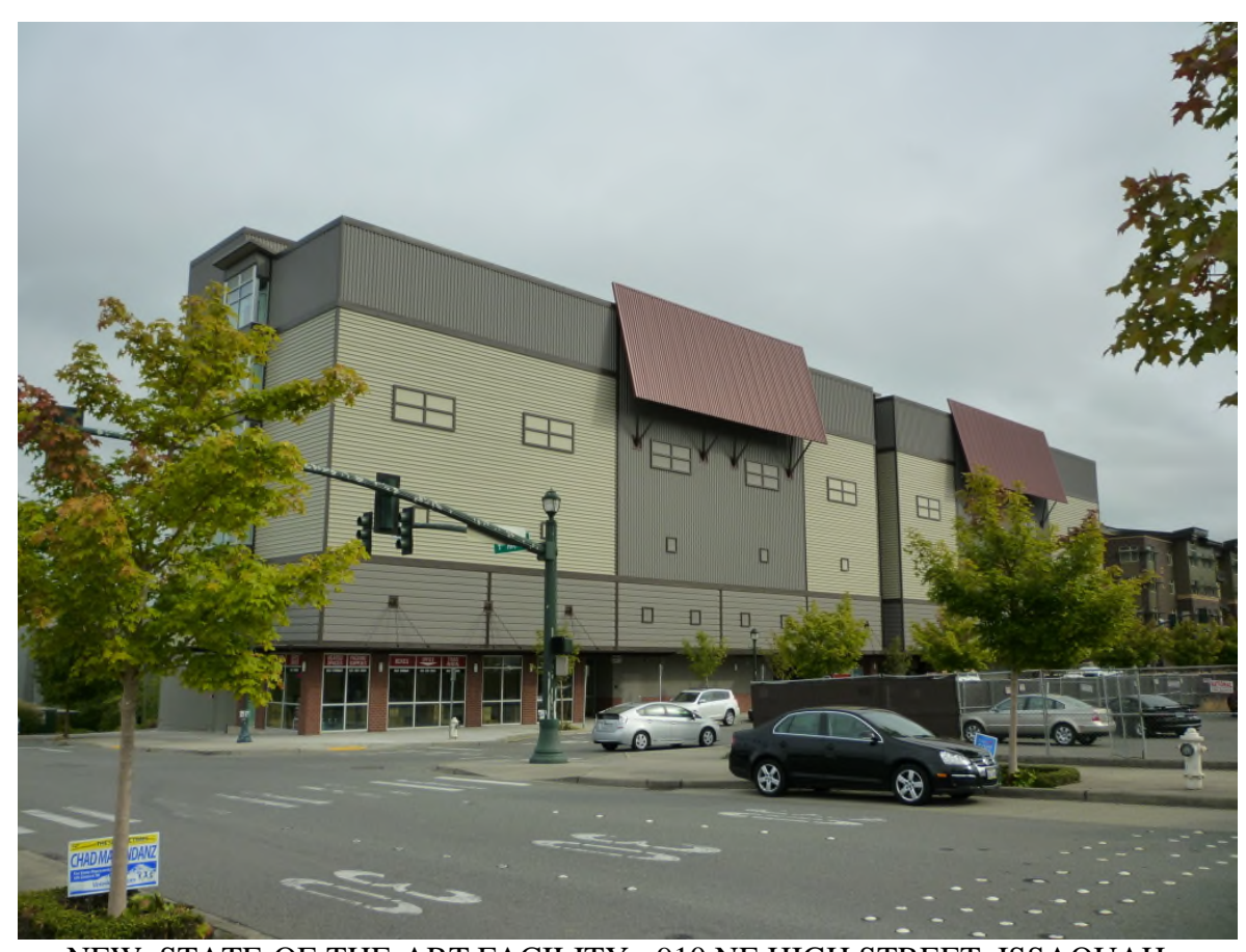
NEW, STATE-OF-THE-ART FACILITY - 910 NE HIGH STREET, ISSAQUAH

substantially in comparison to our current assessed values. As a result, values increased for the third straight year.