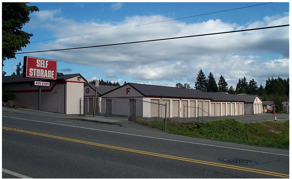
TYPICAL OLDER FACILITY – 18716 68<sup>TH</sup> AVE NE, KENMORE