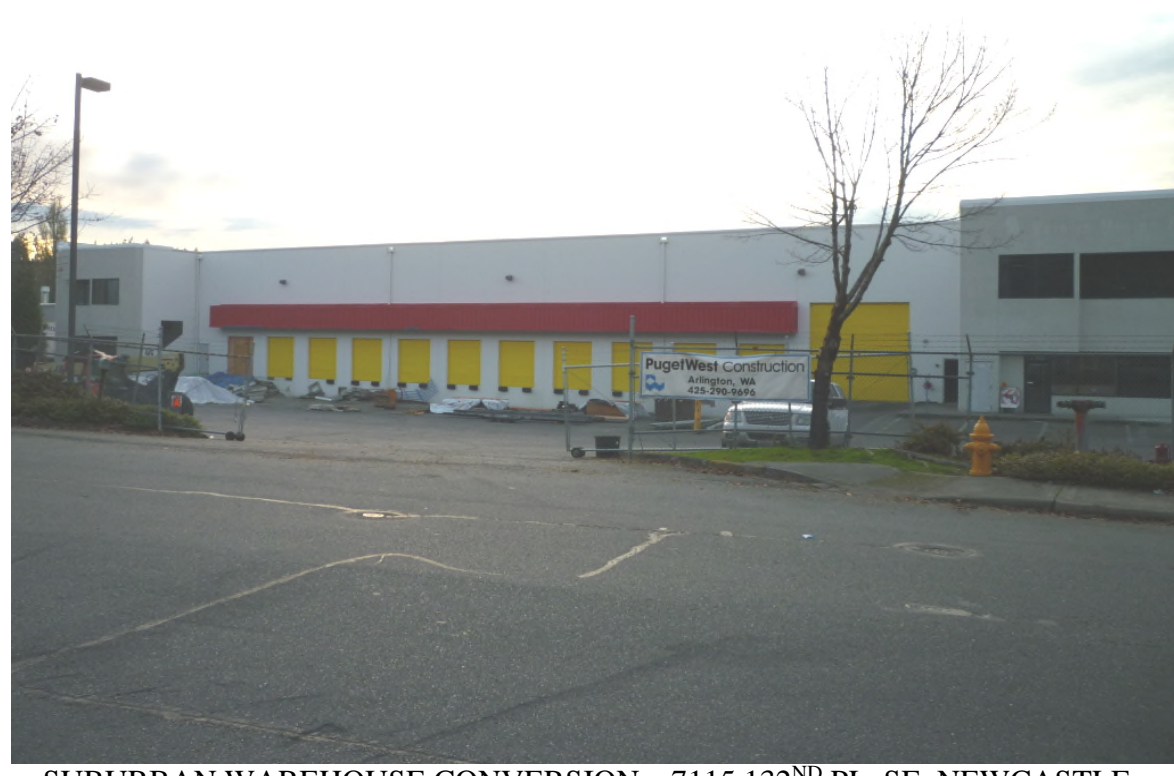
SUBURBAN WAREHOUSE CONVERSION – 7115 132<sup>ND</sup> PL. SE, NEWCASTLE