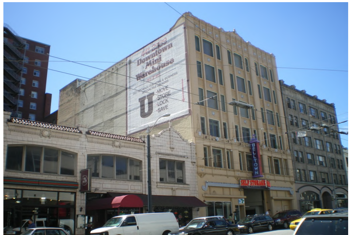
URBAN WAREHOUSE CONVERSION – 1915 3<sup>RD</sup> AVE, SEATTLE