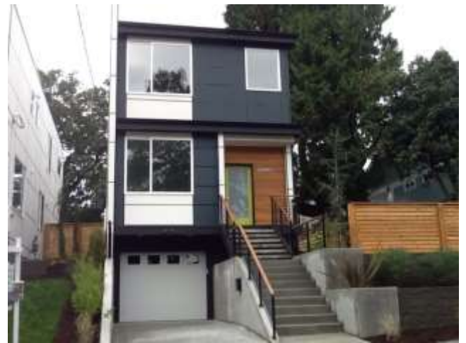
Grade 9/ Year Built 2013/ Total Living Area 2200 Account Number 333100-1880