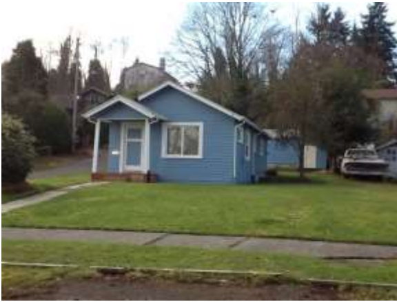
Grade 5/ Year Built 1932/ Total Living Area 560 Account Number 739440-0140