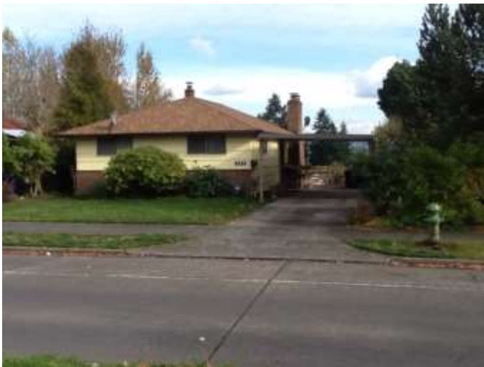
Grade 7/ Year Built 1953/ Total Living Area 2020 Account Number 000740-0128