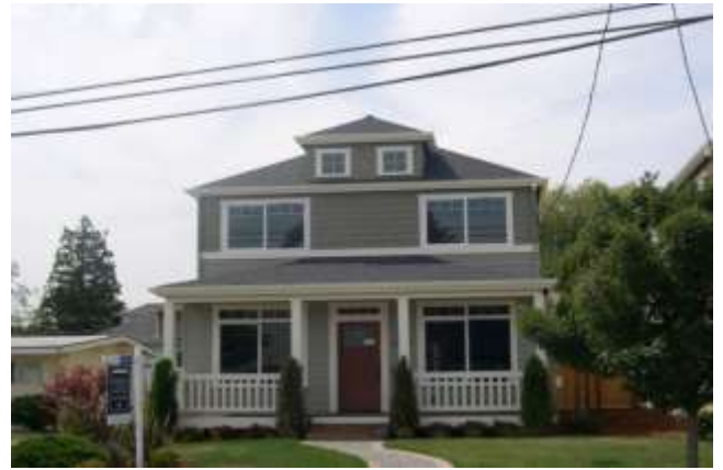
Grade 8/ Year Built 2003/ Total Living Area 1830 Account Number 333600-0835