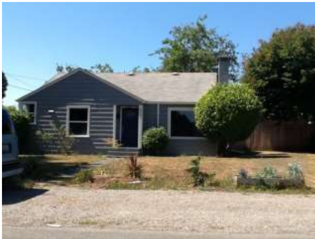
Grade 6/ Year Built 1942/ Total Living Area 1240 Account Number 785700-1605