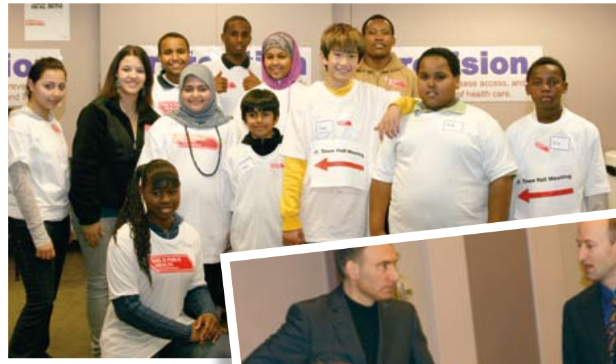
^ Students from the Kent School District help spread the word about Public Health through a sticker campaign called "This is Public Health"

The dramatic achievements of Public Health in the 20th century have improved our quality of life: an increase in life expectancy, world-wide reduction in infant and child mortality, and the elimination or reduction of many communicable diseases.