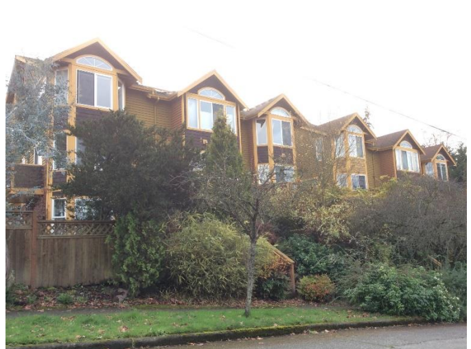
Grade 8 (TH)/Year Built 2002/TLA 1700 SF