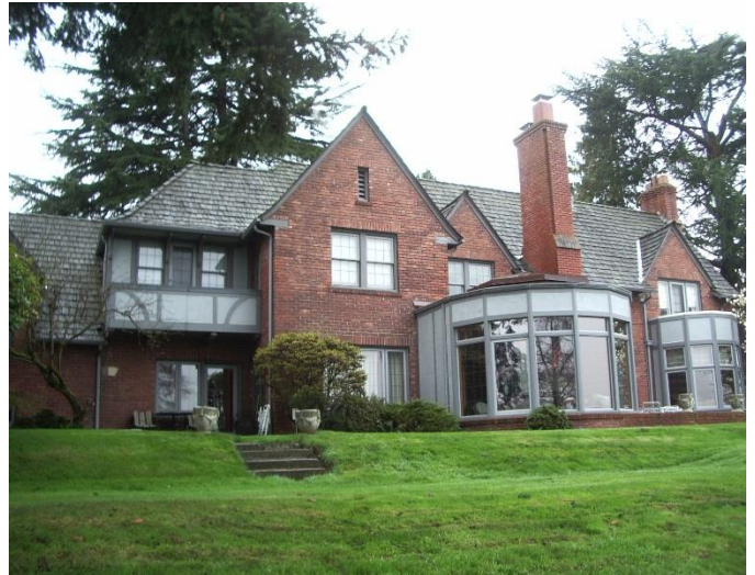
Grade 11/Year Built 1924/TLA 4460SF