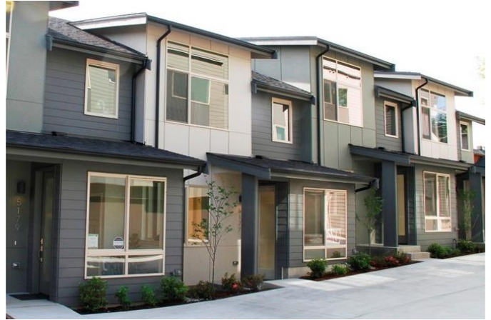
Grade 9 (TH)/Year Built 2017/ TLA 1820 SF