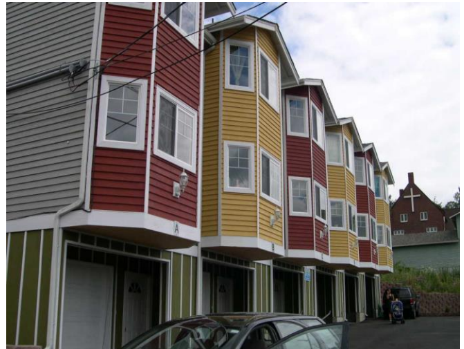
Grade 7 (TH)/ Year Built 2004/ TLA 1030 SF