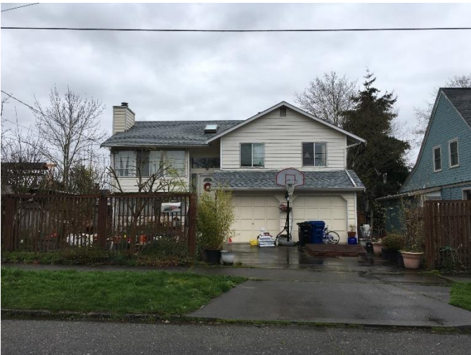
Grade 7/ Year Built 1992/ TLA 2190 SF