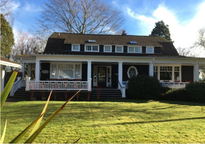
Grade 9/Year Built 1905/TLA 3070 SF