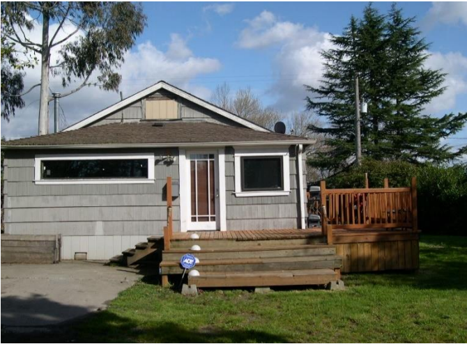
Grade 5/ Year Built 1939/ TLA 770 SF