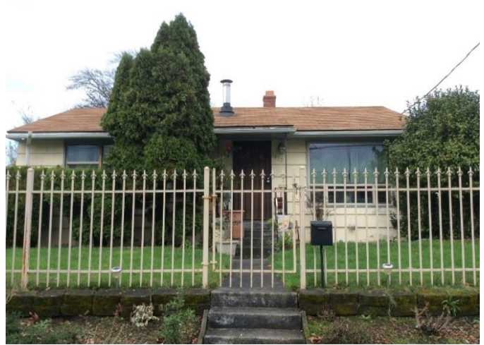
Grade 6/ Year Built 1947/ TLA 860 SF