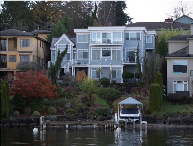
Grade 10/Year Built 1999/TLA 4680 SF