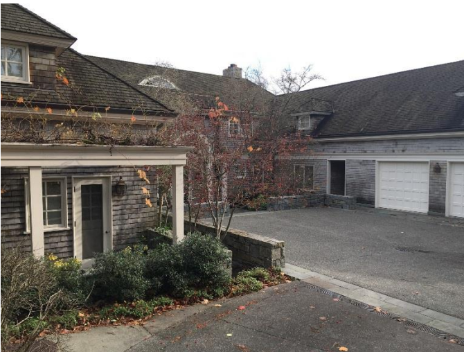
Grade 12/Year Built 1995/TLA 6730 SF