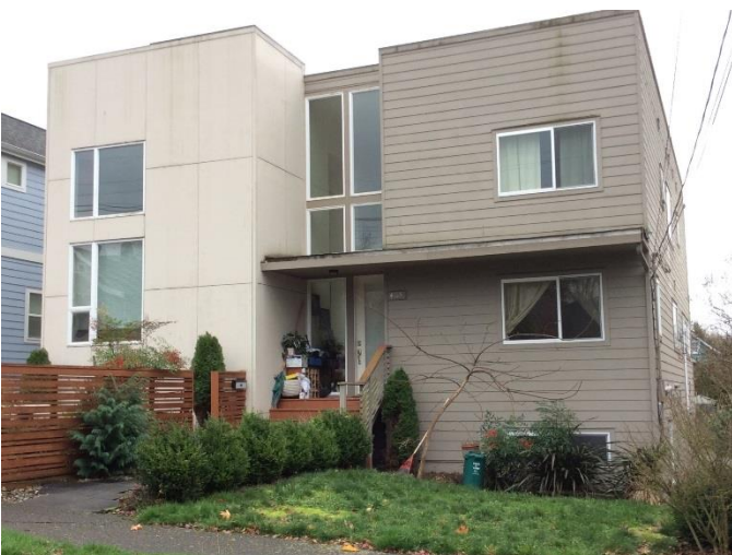
Grade 8/ Year Built 2004/ TLA 3040 SF