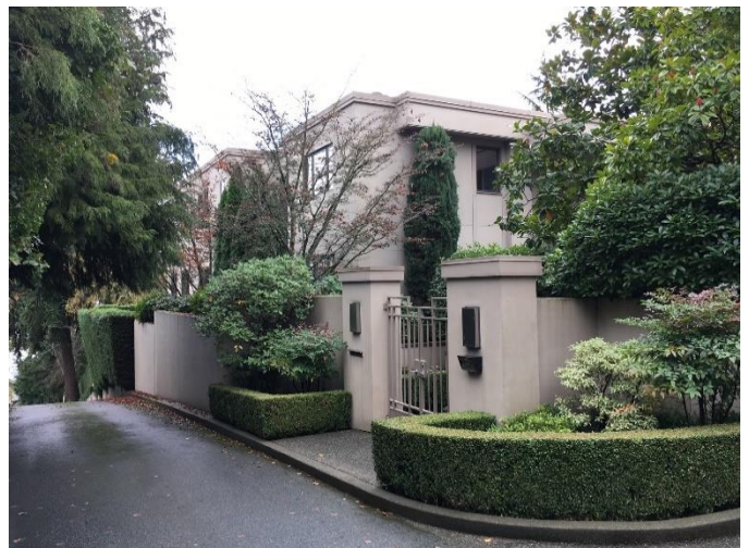
Grade 13/Year Built 1990/TLA 9760 SF