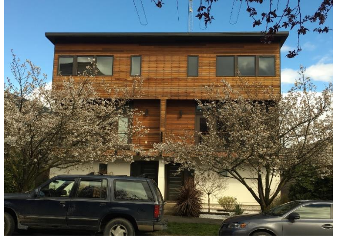
Grade 9 (TH) / Year built 2014 / TLA 2110SF