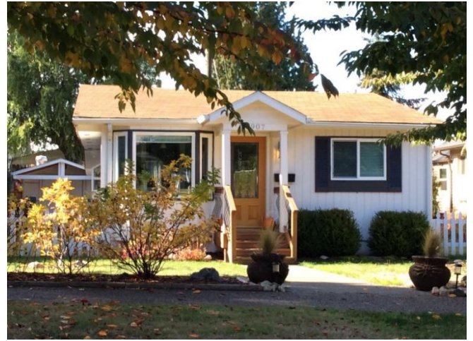
Grade 6 / Year Built 1919 / TLA 1730SF