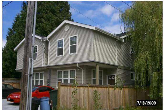
Grade 7 (TH)/Year Built 2000/TLA 1400 SF