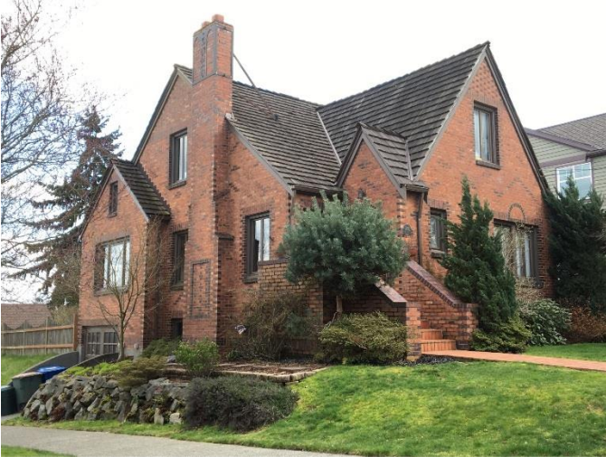
Grade 9 / Year built 1932 / TLA 1440SF