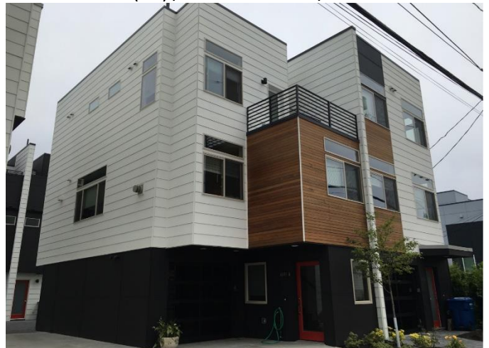
Grade 10 (TH)/ Year Built 2017 / TLA 1590SF