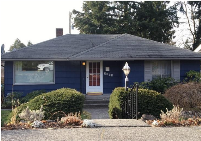
Grade 7 / Year Built 1952 / TLA 1350SF