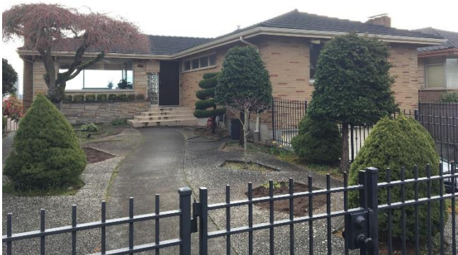
Grade 8 / Year Built 1958 / TLA 2180SF