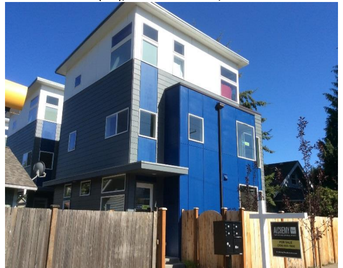
Grade 8 (TH)/ Year Built 2016 / TLA 2000SF