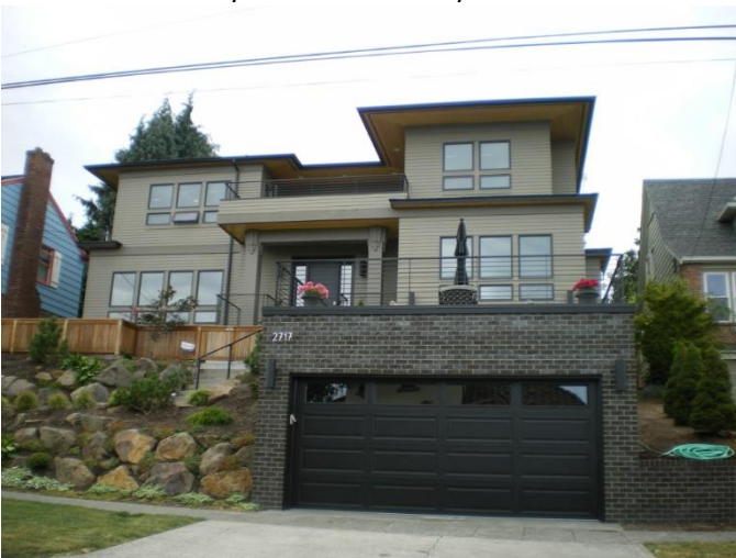
Grade 11/ Year Built 2011 / TLA 4790SF