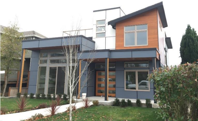
Grade 10/ Year Built 2016 / TLA 4340SF