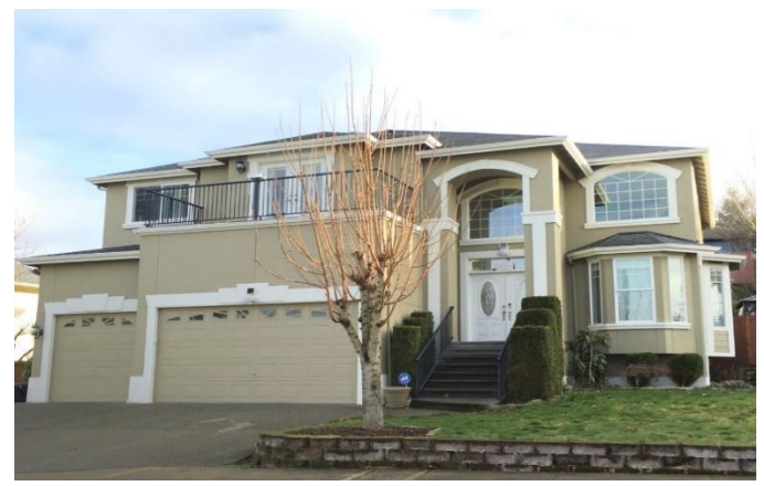
Grade 9/ Year Built 2004/ 3,130sf Total Living Area

Area Error! Reference source not found. Area Information