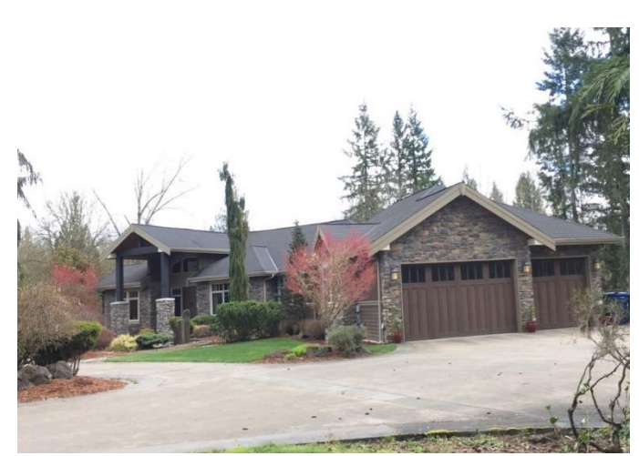
Grade 11 / Year Built 2006 / 4,490sf Total Living Area