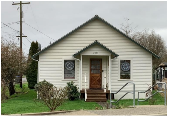
Grade 4/ Year Built 1937/ 960sf Total Living Area