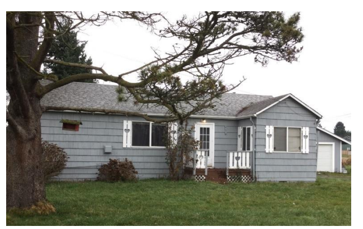
Grade 6 / Year Built 1945 / 1,260sf Total Living Area