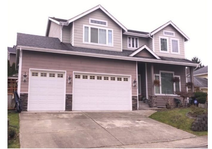
Grade 8/ Year Built 2002/ 2,650sf Total Living Area