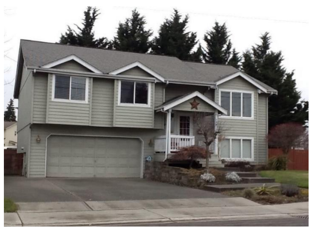
Grade 7/ Year Built 1996/ 1,980sf Total Living Area