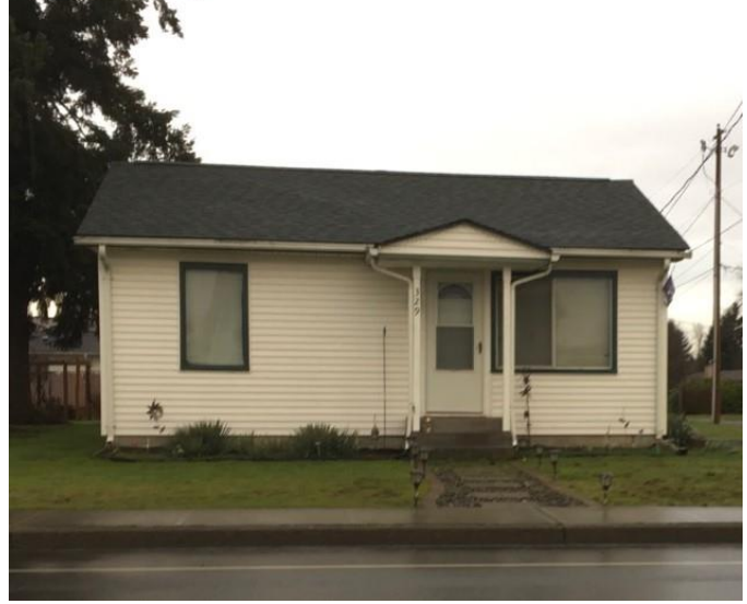
Grade 5/ Year Built 1956 / 630sf Total Living Area