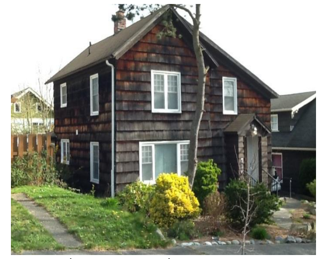
Grade 6/ Year Built 1908/ Total Living Area 1,490