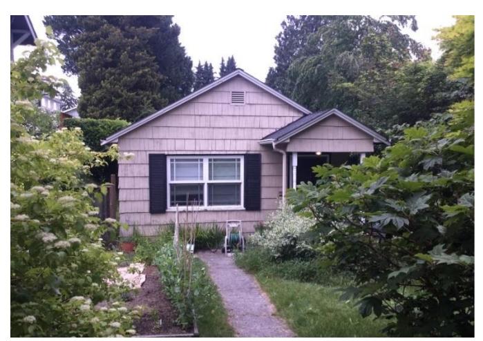
Grade 5/ Year Built 1931/ Total Living Area 850