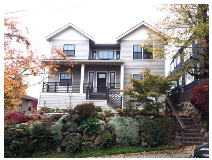
Grade 9/ Year Built 2018/ Total Living Area 3,140