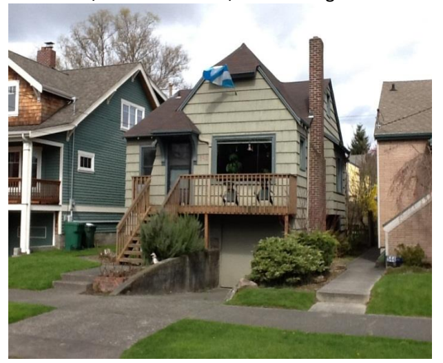
Grade 7/ Year Built 1928/ Total Living Area 1,190