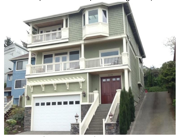
Grade 10/ Year Built 2004/ Total Living Area 4,210