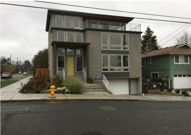
Grade 9/ Year Built 2016/ Total Living Area 4,690 sf