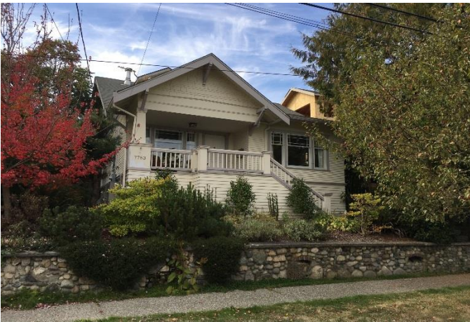
Grade 7/ Year Built 1920/ Total Living Area 2,450 sf