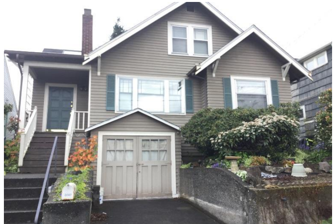
Grade 8/ Year Built 1927/ Total Living Area 1,660 sf