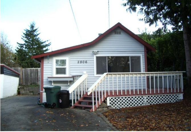
Grade 5/ Year Built 1928/ Total Living Area 420 sf