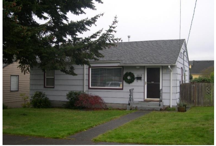
Grade 6/ Year Built 1943/ Total Living Area 770 sf