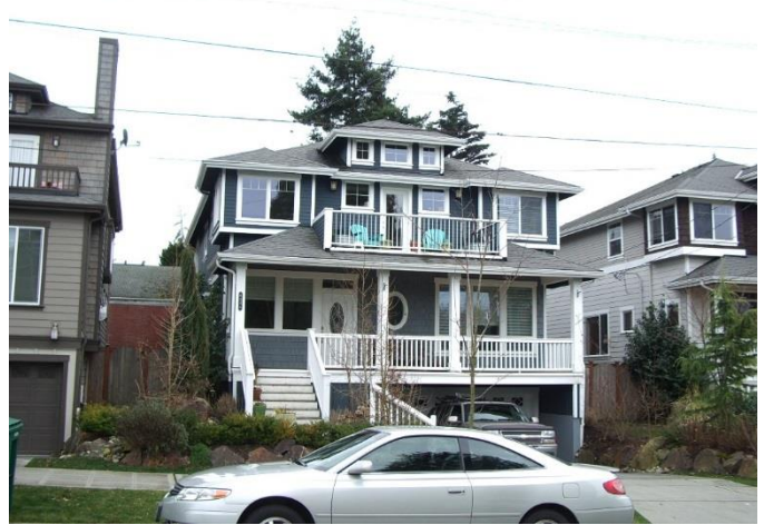
Grade 10/ Year Built 2006/ Total Living Area 3,520 sf