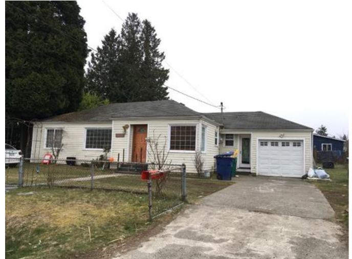
Grade 6/ Year Built 1941/ Total Living Area 1,520