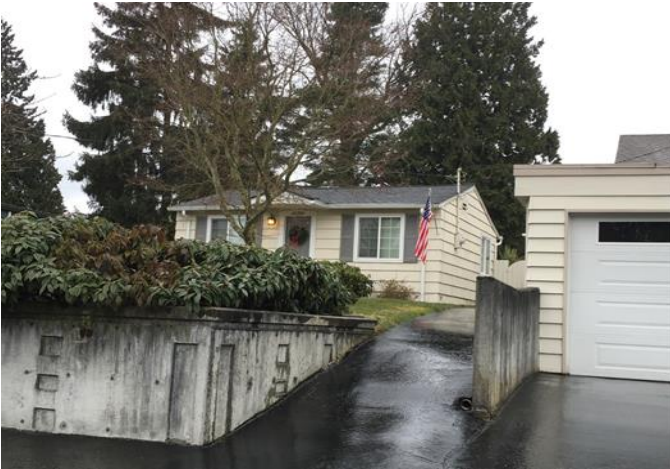
Grade 5/ Year Built 1949/ Total Living Area 630