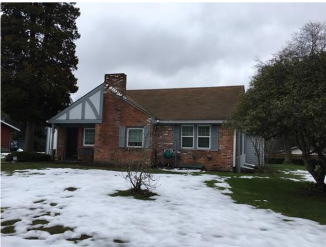
Grade 7/ Year Built 1931/ Total Living Area 1,510