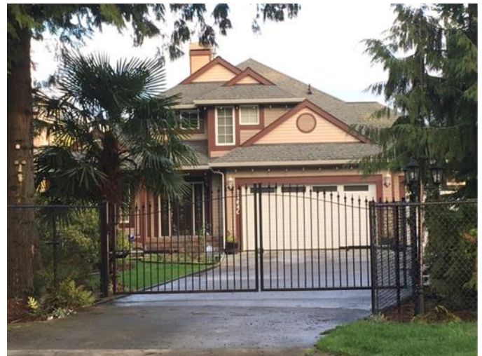
Grade 8/ Year Built 1996/ Total Living Area 2,210