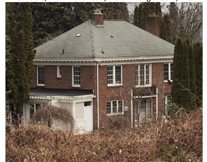
Grade 10/ Year Built 1920/ Total Living Area 4,160