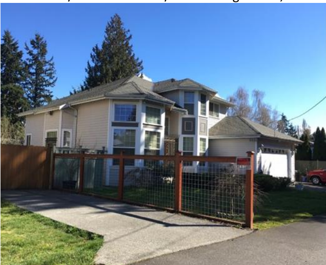
Grade 9/ Year Built 2006/ Total Living Area 2,470