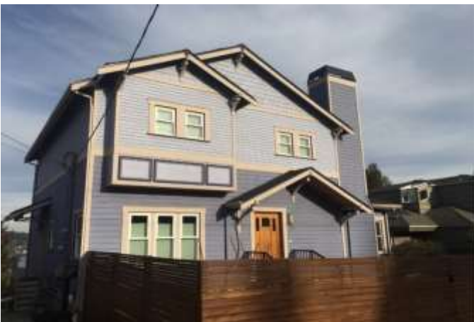
Grade 9/ Year Built 2007/ TLA: 3120 SF