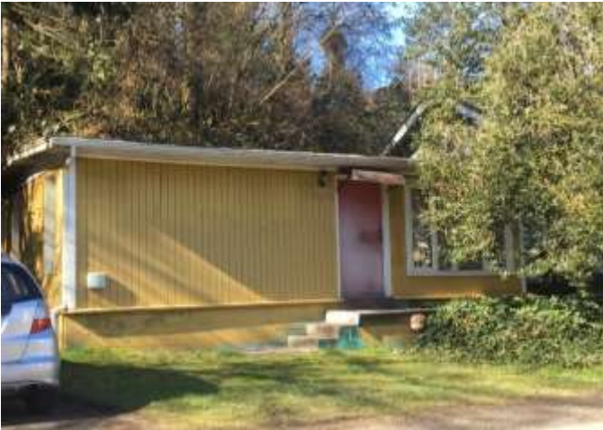
Grade 5/ Year Built 1950/ TLA: 460 SF