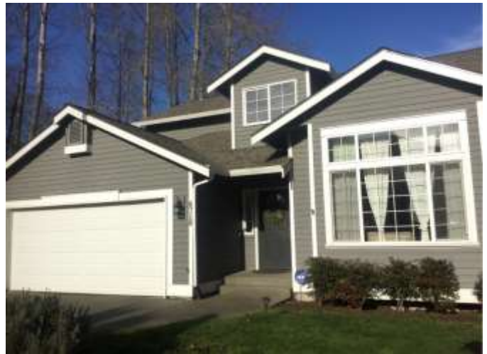
Grade 8/ Year Built 1996/ TLA: 1840 SF