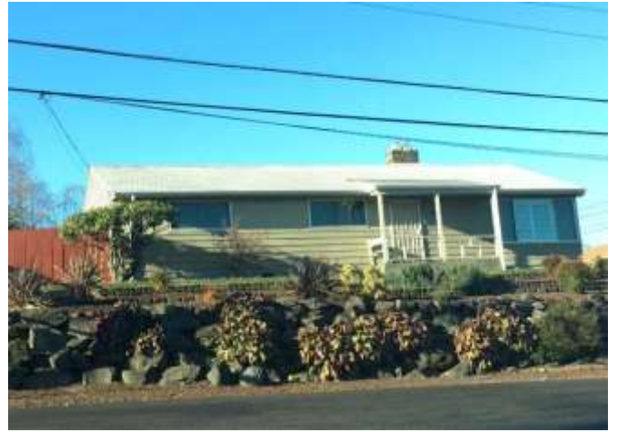
Grade 6/ Year Built 1955/ TLA: 1550 SF