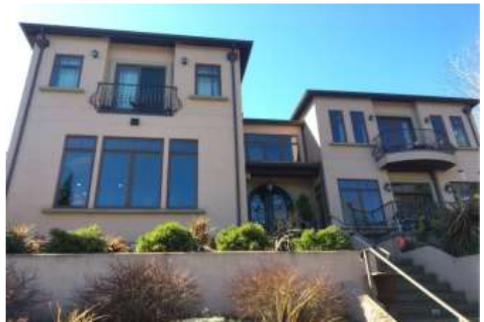
Grade 11/ Year Built 2008/ TLA: 3710 SF