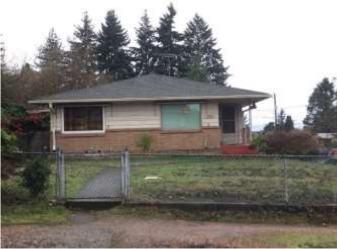
Grade 7/ Year Built 1956/ TLA: 1620 SF