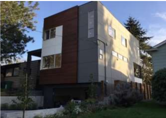
Grade 9/ Year Built 2014/ Total Living Area 3,080 sf