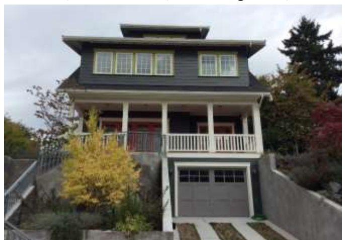
Grade 10/ Year Built 2013/ Total Living Area 4,020 sf