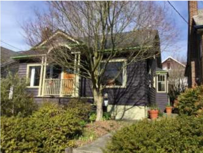
Grade 7/ Year Built 1926/ Total Living Area 1,670 sf