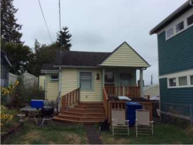
Grade 5/ Year Built 1916/ Total Living Area 700 sf