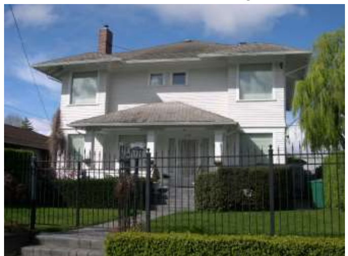
Grade 8/ Year Built 1910/ Total Living Area 2,610 sf