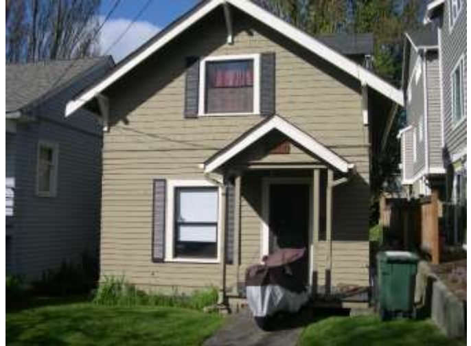
Grade 6/ Year Built 1912/ Total Living Area 950 sf