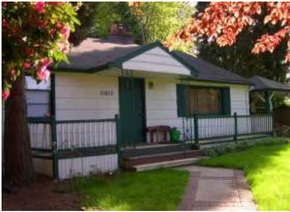
Grade 6/ Year Built 1952/ Total Living Area 1260 Account Number 162605-9144