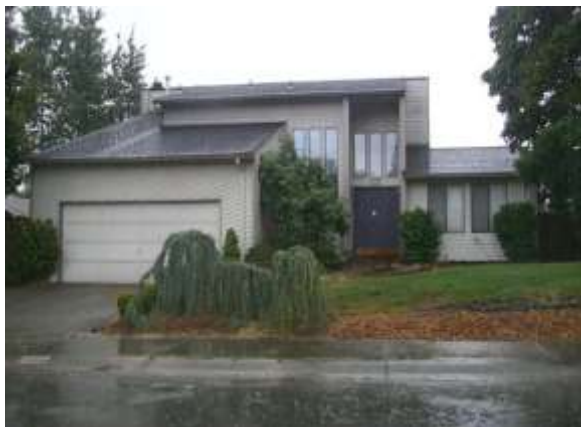
Grade 8/ Year Built 1980/ Total Living Area 1780 Account Number 233530-0030