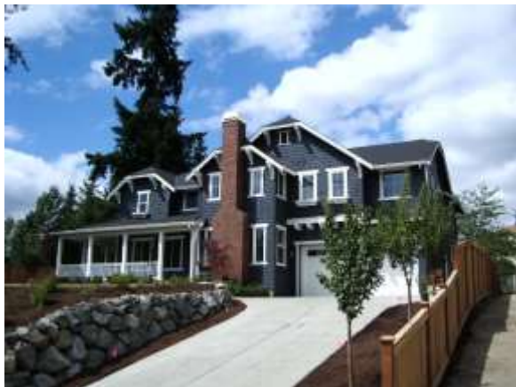
Grade 10/ Year Built 2006/ Total Living Area 3900 Account Number 178930-0020