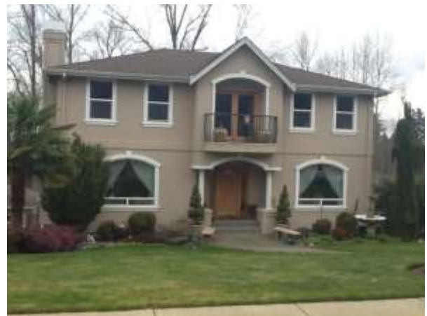
Grade 9/ Year Built 2001/ Total Living Area 3760 Account Number 563450-0905