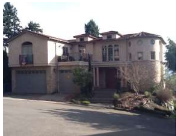
Grade 11/ Year Built 2003/ Total Living Area 5260 Account Number 033310-0227