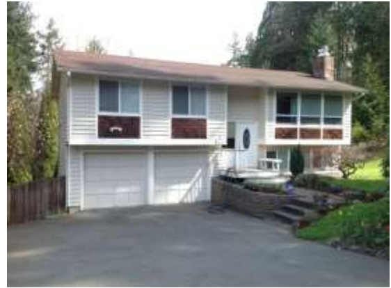
Grade 7/ Year Built 1977/ Total Living Area 1650 Account Number 701800-0200